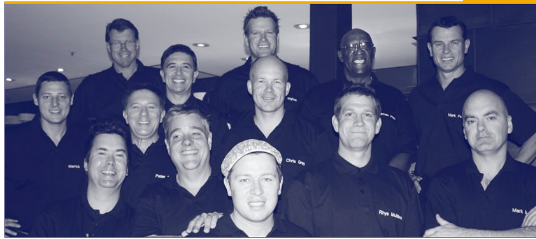
This year's celebrity's cooking up a storm!

One of the highlights on our event calendar is 'Real Men Cook'. This event continues to be a sell out and has tremendous support by celebrities who like to showcase their culinary expertise and raise money for a great cause.