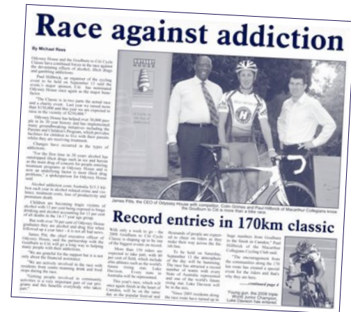
Macarthur Chronicle, Tuesday September 9, 2008