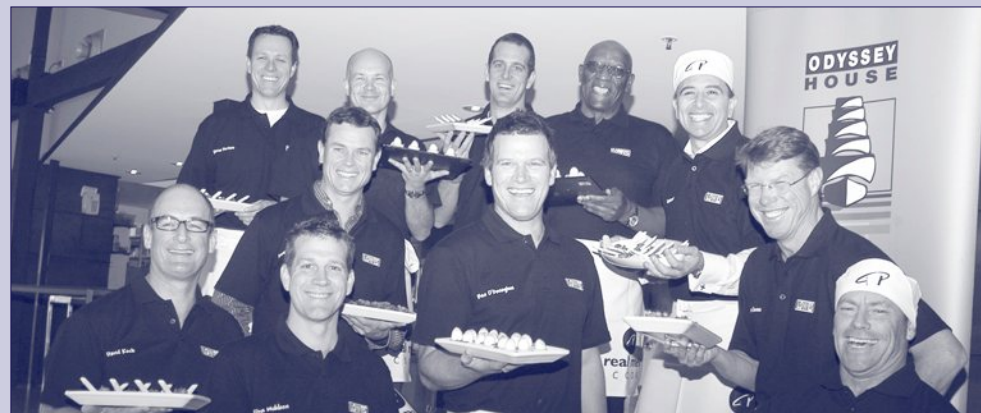
Real Men 'Celebrity' chefs of 2008!

The event concluded with a live auction conducted by Channel Seven's David Koch, which contributed to raising over $35,000 a wonderful result!